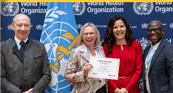
VisionSpring leadership in Geneva for the launch of WHO SPECS 2030 in May 2024